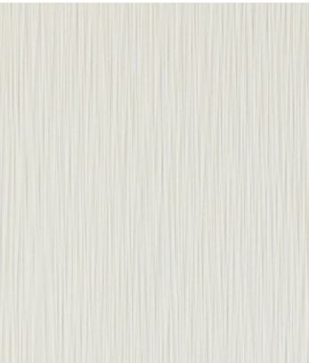
Hardie™ Brushed Concrete Cladding