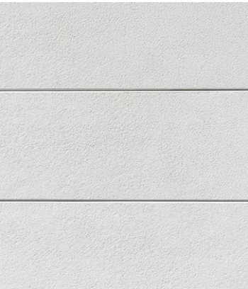
Stria™ Cladding Fine Texture

We’ve taken design versatility to a new level. The Hardie™ Architectural Collection combines the renowned durability and product performance of our existing exterior cladding portfolio, with new distinctive textures and profiles, to transform the way Australia builds modern homes. Created to complement each other, this curated collection offers endless design possibilities, so you can build modern homes from the ground up, with confidence. The Hardie™ Architectural Collection offers a modern, simple integrated solution of selected Hardie™ fibre cement products and Hardie™ accessories to deliver modern looks with the trusted protection and lasting beauty of Hardie™ fibre cement technology. As architectural trends evolve, this collection empowers homeowners and trade professionals to design and build modern, resilient homes that meet today’s demands for style and performance.