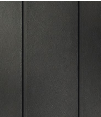
Hardie™ Oblique™ Cladding